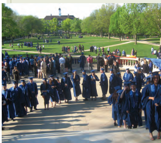
Members of the graduating class of spring 2013 approach Foellinger Auditorium to take part in the Convocation ceremony held on May 11.

On Saturday, May 11, 130 graduates and 39 faculty members participated in the Spring Convocation ceremony for the School of Literatures, Cultures and Linguistics, held in Foellinger Auditorium.