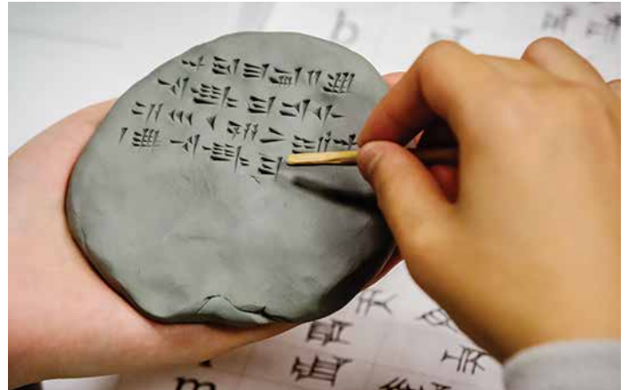
A student writes in Hittite using cuneiform symbols pressed into clay. The University of Illinois linguistics department offered a course in Hittite for the first time this past fall.